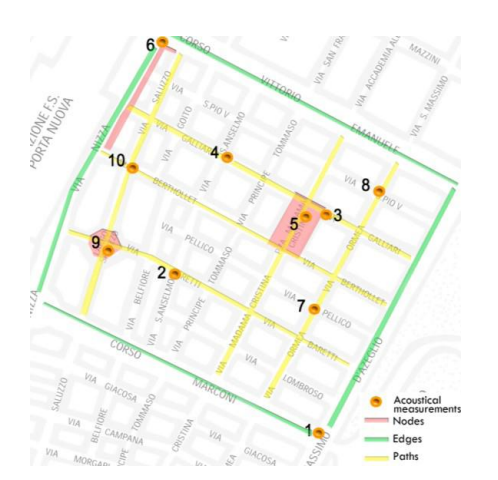
Figure 1. Key-spaces and acoustical measurement points lightized on the map of San Salvario [nodes: n.1 market square (5), n.2 Saluzzo square (9) and n.3 arcades (6)].

urban blight (both in architectural and environmental terms); 3) objective investigation of environmental quality through the measurement of acoustic, light, thermal and IAQ physical parameters.